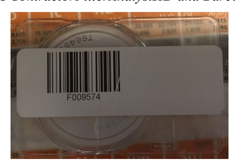
Figure 1. Filter label (same as ContractorFilterAnalysisID and BarcodeID ).

Petri Tray Labels: The operator prints unique Petri tray labels after inventory. The labels include the ContractorBatchID , tray number, and QR barcode for each petri tray (Figure 2). Only the last two digits of the ContractorBatchID are used for the label (e.g. A0000019 is Batch 19). To differentiate between Teflon and Quartz trays add "Quartz" to the tray label, eg Quartz- B19T1.